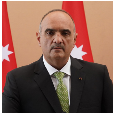
Bisher Al Khasawneh

Born on January 27, 1969, Khasawneh holds a PhD in law from the London School of Economics. He also worked as an adviser for policies to His Majesty King Abdullah as of August 18, 2020 and adviser to King Abdullah for communications and coordination between 2019 and 2020 and Jordan's permanent representative to UNESCO between 2018 and 2019. Khasawneh was also the Kingdom's ambassador to France between 2018 and 2019 and to Egypt between 2012 and 2016, when he also was Jordan's permanent representative to the Arab League in Cairo, in addition to serving as a